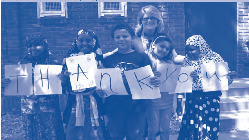
Students at Longfellow Elementary School, Minneapolis