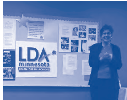
Ann Bancroft shares her stories of overcoming dyslexia

To help us celebrate, Ann Bancroft, polar explorer and educator, spoke about her own personal challenges with dyslexia, diagnosed as a young student. Her ability to overcome this learning disability gave her confidence to fulfill her aspirations into adulthood and was inspiring for those who heard her story.